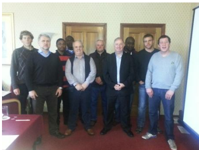
NEBOSH IOG, Aberdeen-UK, 18 - 22 Mar 2013

The next training has been scheduled in Bali-Indonesia on 17 - 21 Jun; Singapore on 24 - 28 Jun; Aberdeen-UK on 15 - 19 Jul; Manila-Philippines on 22 - 26 Jul; Hong Kong on 29 Jul - 2 Aug; Yangon-Myanmar on 5 - 9 Aug 2013. Click Here for the flyer or Contact us for more information