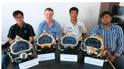
KMDSI, Singapore (18-20 Mar2013)

KBA Training has trained several personnel on Kirby Morgan helmets in the month of April. With the popularity, we have scheduled more training dates in Singapore on the 22 - 24 Jul, 12 - 14 Aug, 9 - 11 Sep, 21 - 23 Oct, 11 - 13 Nov, 2 - 4 Dec 2013. Click Here for the flyer.