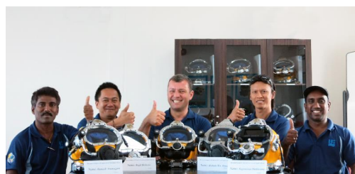
KMDSI, Singapore (10 - 12 Apr 2013)