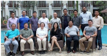
Training NEBOSH ITC in Oil and Gas Operational Safety Batch X At Sheraton Hotel, Bandung - Indonesia Held on 8 th - 12 th April, 2013 www.phitagnms.co.id

NEBOSH IOG, Bandung-Indonesia, 8 - 12 Apr 2013