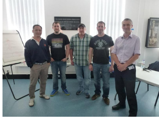
DMTR, Chichester, UK (29Apr-3May 2013)