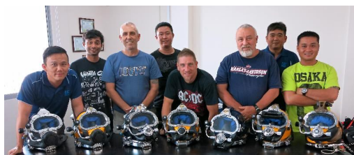
KMDSI, Singapore (15-17 Apr2013)