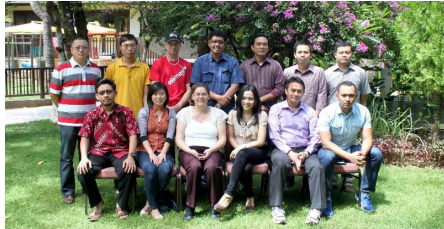
Training NEBOSH IGC in Occupational Safety and Health Batch XIV At Novera Nusa Dua, Bali - Indonesia Held on 22 nd April - 4 th May, 2013 www.phitagnms.co.id

The NEBOSH International General Certificate course was held in Bali, Indonesia on the 22 April - 4 May 2013.