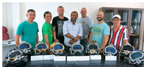
KMDSI, Singapore (6 - 8 May 2013)