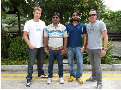
DMT, Singapore (6 - 13 May 2013).

Click Here for the flyer or Contact us for more information.