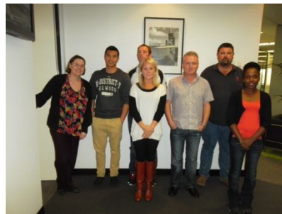
NEBOSH IOG, Perth-Australia, 13 - 17 May 2013